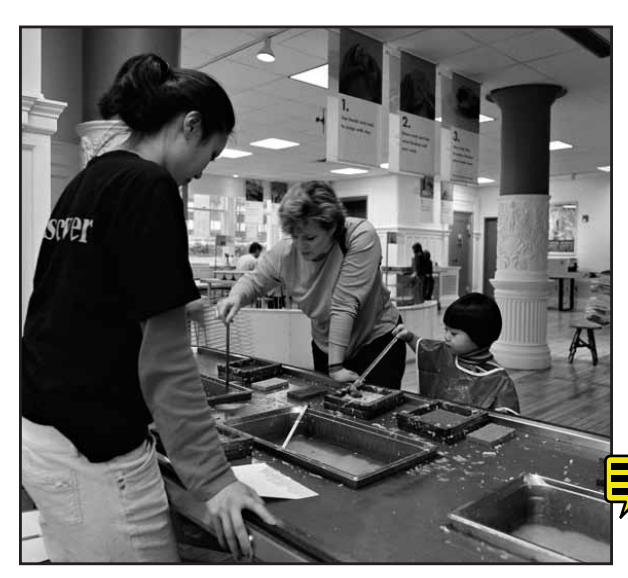
Figure 4. "Real Stuff": Parent and child making paper together at the Children's Museum.

The first step was to make the space inviting to adults as well as children. The museum redesigned the studio space and other exhibit areas in the museum using a concept they called "real stuff." This concept focused on using real objects and tools in an authentic way in settings that were inviting for adults and that could encourage joint activity. In the studio, this meant that real, as opposed to "crafty," materials were provided. For example, a selection of brushes, palettes, and colors replaced single brush pots at the easels. Easels were both child-sized and adult-sized. Prints and a historic puppet display from the museum's collections were hung in the space. The aesthetic of the space was carefully considered as part of the new philosophy, including natural light, hardwood floors, specially designed concrete tables created for the ceramics area, and a custom-built table for papermaking.